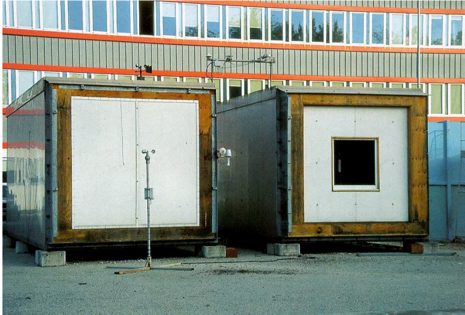
Figure 1. Homogeneous opaque insulated panel and a simple window system placed in the south wall.

heater is used to excite the system and is controlled applying a pseudo randomly ordered on/off sequence [14]. In general, the thermal and solar characteristics of the test specimens are a function of the indoor and outdoor environment conditions, such as temperature level, temperature difference, solar radiation level and position of the sun and sky conditions (clear, overcast). This implies that in case the intention of the test is to obtain results in terms of product information, the characteristics derived from the test may require conversion from actual test conditions to certain standard conditions, such as conditions specified in European standards.