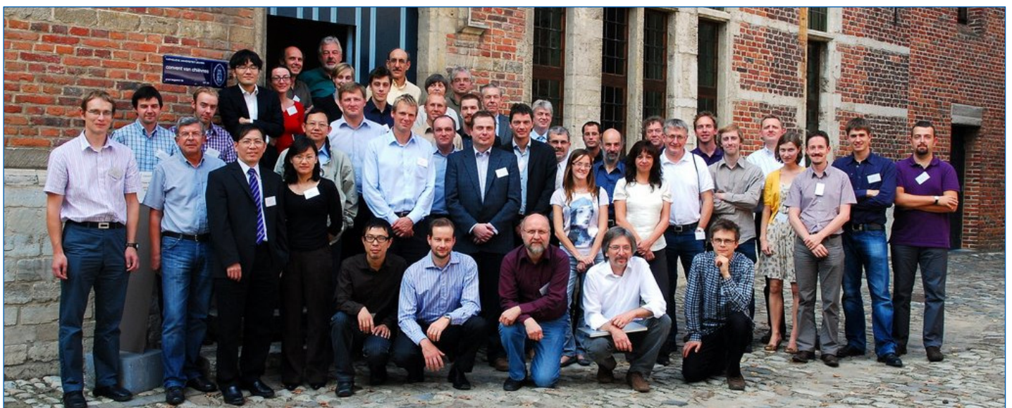
Participants of the first preparation meeting, September 26-27, 2011, Leuven. In total 45 participants from 29 different institutes and 15 different countries were present.

International Energy Agency Energy Conservation in Buildings and Community Systems Programme